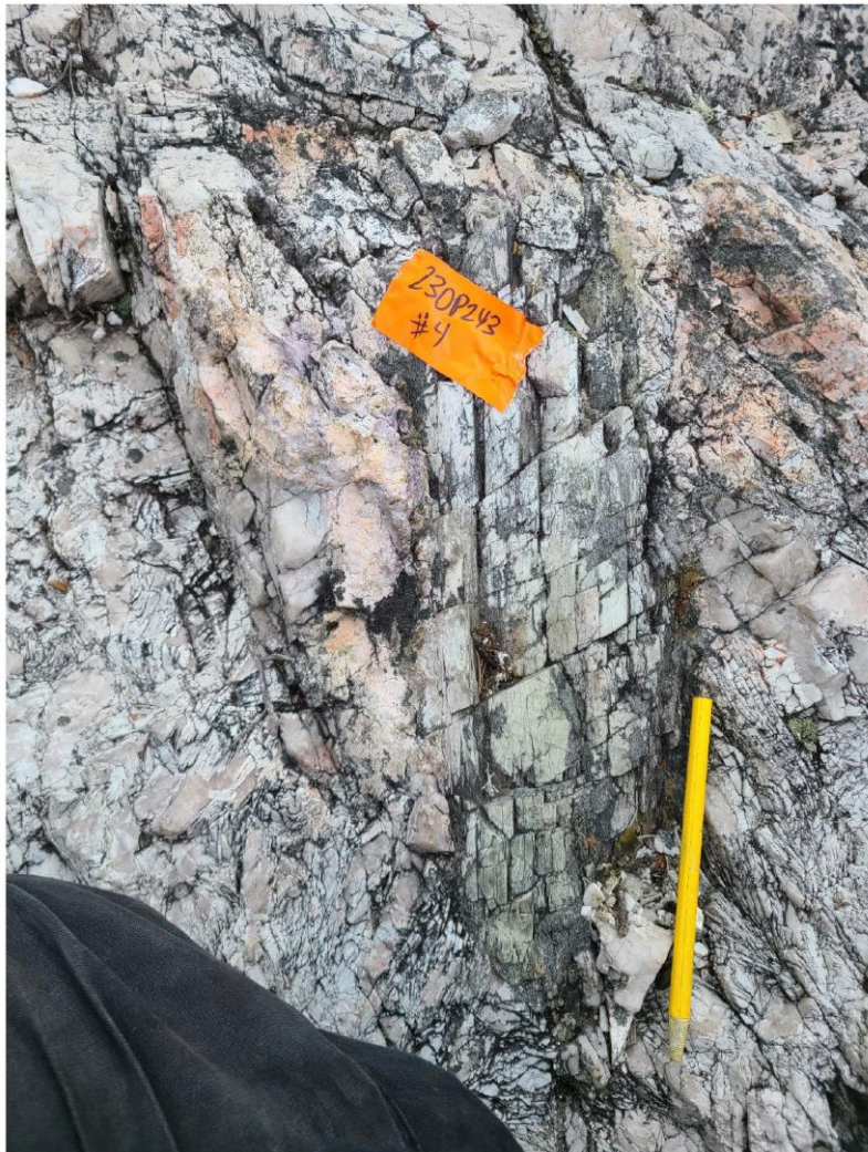
Figure 2 | Large green spodumene crystal with fine lepidolite near left crystal margin